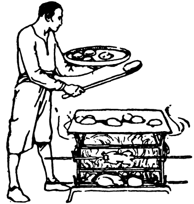
One of Duke William's army cooks (from "Everyday Life in Anglo-Saxon, Viking and Norman Times," M. and C. H. B. Quennell)

Children are luckier to-day—and grown-ups, too. Here are three books* written