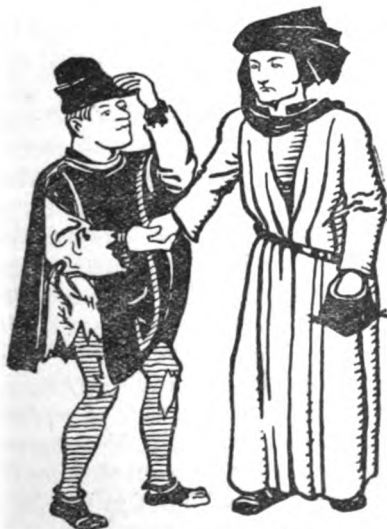
A beggar—being lucky (from "Life and Work in the Fifteenth Century.")

The illustrations (by the authors) are just as simple and beautiful and to the point as the writing. William the Conqueror's invasion becomes something more than a