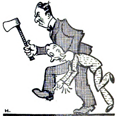
About Secretaries with Outstanding Accounts.